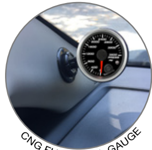
CNG FUEL LEVEL GAUGE