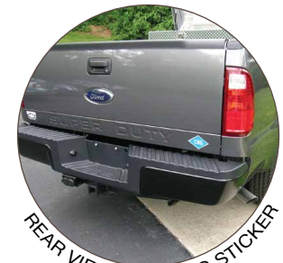
REAR VIEW WITH CNG STICKER