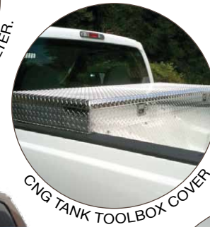
CNG TANK TOOLBOX COVER