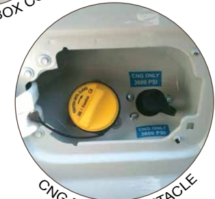
CNG FUEL RECEPTACLE