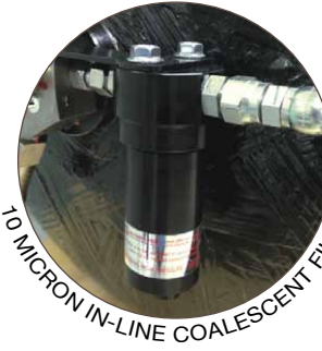
10 MICRON IN-LINE COALESCENT FILTER