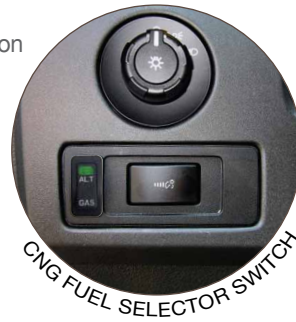
CNG FUEL SELECTOR SWITCH