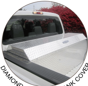
DIAMOND PLATE CNG TANK COVER