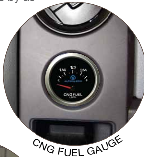
CNG FUEL GAUGE