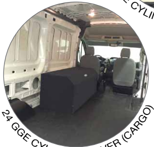
24 GGE CYLINDER COVER (CARGO)