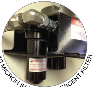
10 MICRON IN-LINE COALESCENT FILTER