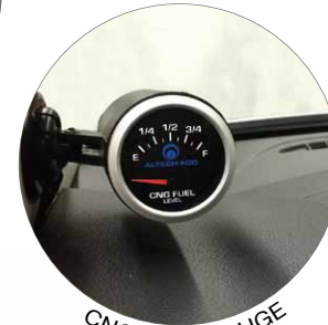
CNG FUEL GAUGE