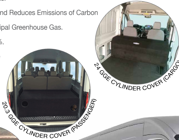
24 GGE CYLINDER COVER (CARGO)