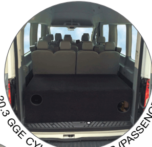
20.3 GGE CYLINDER COVER (PASSENGER)