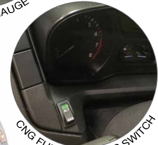
CNG FUEL SELECTOR SWITCH