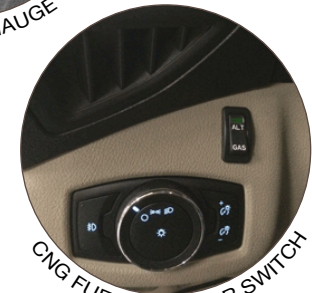
CNG FUEL SELECTOR SWITCH