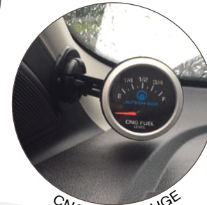
CNG FUEL GAUGE