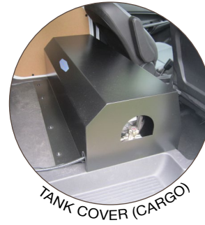
TANK COVER (CARGO)