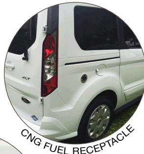
CNG FUEL RECEPTACLE