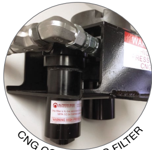
CNG COALESCING FILTER