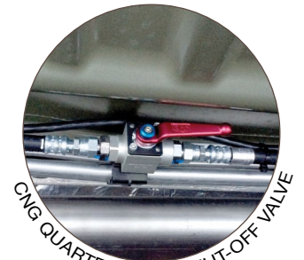
CNG QUARTER TURN SHUT-OFF VALVE